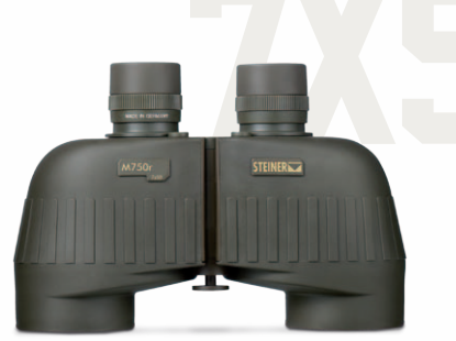
ITEM NUMBER 2651