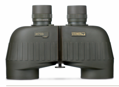
ITEM NUMBER 2650